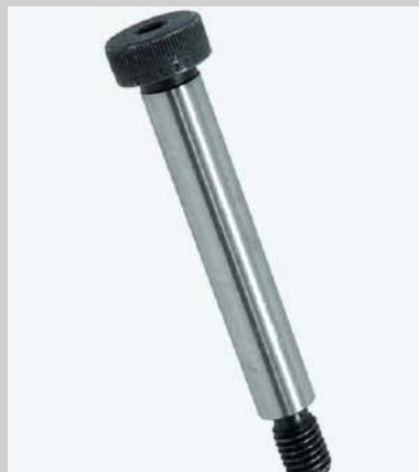
DIN 9841/ISO 7379