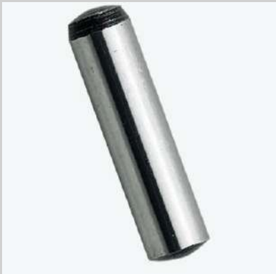
DIN 6325/ISO 8734