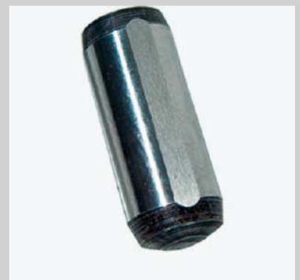
DIN 7979/ISO 8735