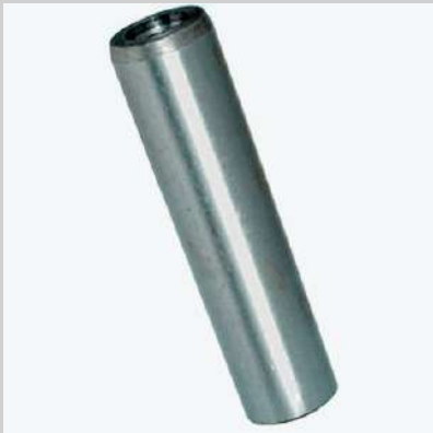
DIN 7978/ISO 8736